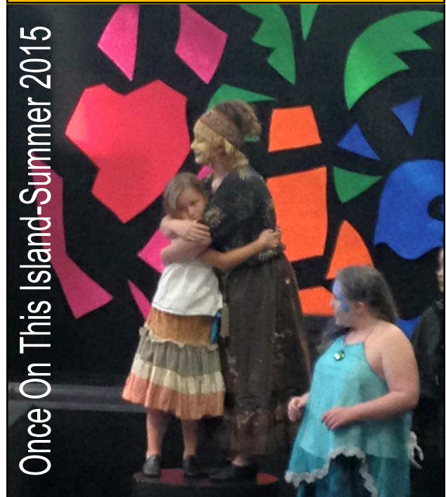
Once On This Island-Summer 2015