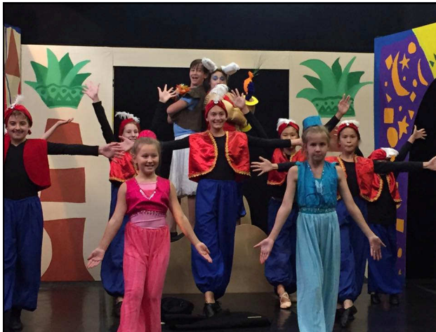
Aladdin - Summer 2016

Read about us in the February, 2017 issue Of West Hartford Life!